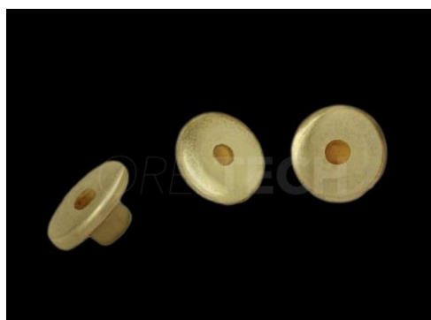
OrelTech Aurum gold-coated ECG electrodes