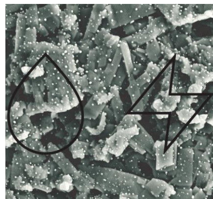
Otech Platinum as Thin Film (left), Large Area structure (middle) and Nanoparticle Deposition (right)