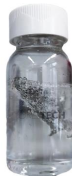
OTech Platinum catalytic effect

OrelTech's unique process allows printing and aerosol spraying of highly conductive platinum thin films or non-connected nanoparticle islands. Printed layers undergo short development (curing) using plasma treatment resulting in a thin fine pure platinum structure. OrelTech inks in liquid form do not contain nanoparticles and are significantly environmentally friendlier than the alternatives on the market. Lack of nanoparticles also allows them to be much more cost-effective than other conductive inks.