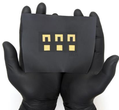
OrelTech Aurum gold electrode on fabric