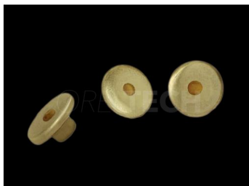
OrelTech Aurum gold-coated ECG electrodes